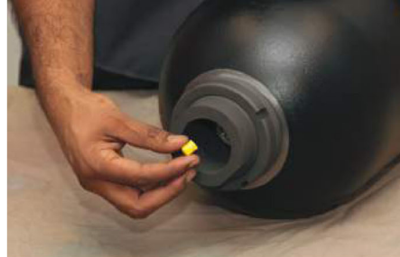
2) Remove the seal cap from the gas valve.