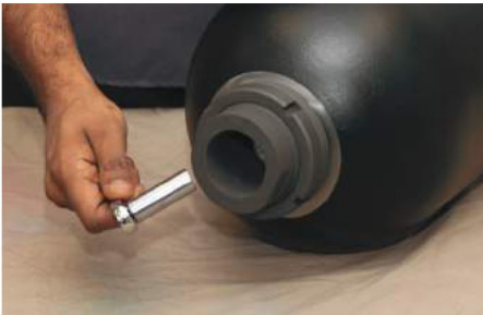
4) Remove the gas valve adaptor using an appropriate socket wrench. Skip this step if the accumulator is mounted vertical on system.