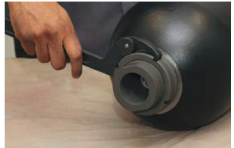
6) Remove the locknut using the spanner wrench.