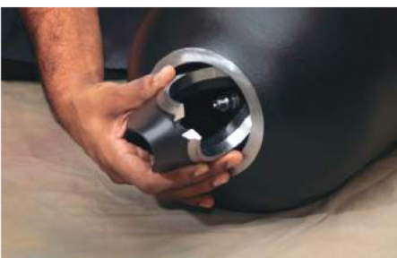
10) Remove the Anti-Extrusion ring from the top adaptor. Fold the ring and retrieve from the shell.