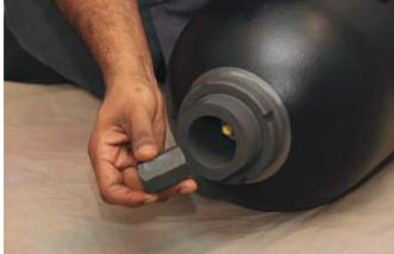
1) Remove the protective cap.

After disassembly, it is recommended to replace all the rubber parts. All the metallic parts must be thoroughly cleaned with organic solvent.