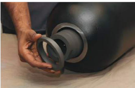
7) Remove spacer ring. For the next steps, care should be taken not to drop parts inside the shell if the service is conducted while the accumulator is vertical installed in the system.