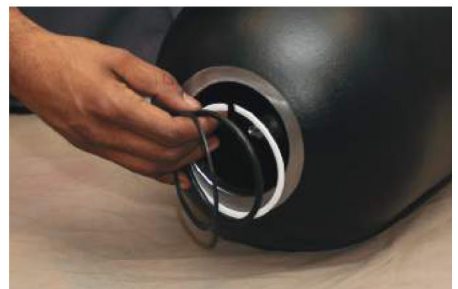
9) Remove the O-Ring back up, O-Ring & Teflon rings.