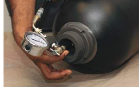
3) Discharge completely the nitrogen precharge pressure using the charging & gauging assembly.