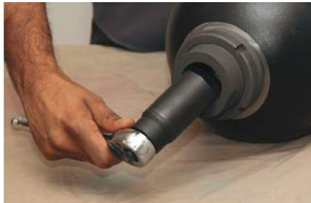
5) Remove the Jam nut using appropriate socket wrench.