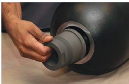
11) Remove the Top adaptor from the shell.