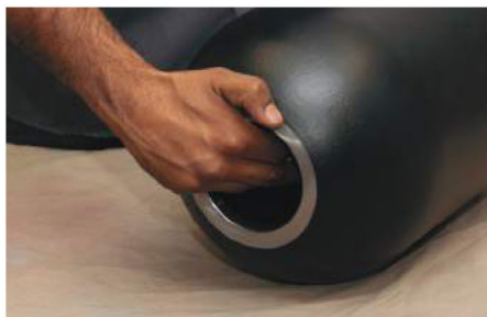
8) Push the top adaptor inside the shell. If it does not go inside possibly due to trapped residual pressure, consult factory.