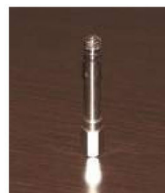
Valve Extension P/N: CK-013