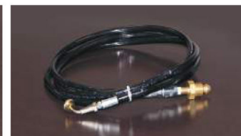
Hose Assembly P/N: CK-014