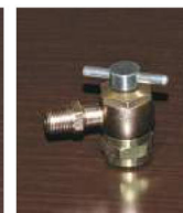
Air Chuck P/N: CK-005