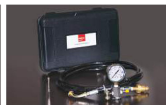
C&G Kit P/N: CKT-T-0030