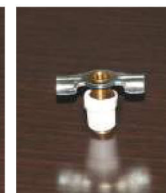
Bleed Valve P/N: CK-011