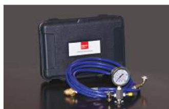
C&G Kit P/N: CKT-0030