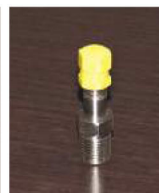
Tank Valve P/N: CK-010