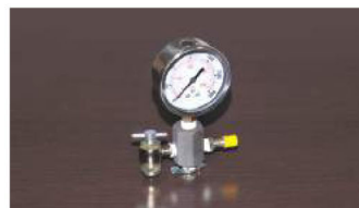
C&G Kit P/N: CKM-0030